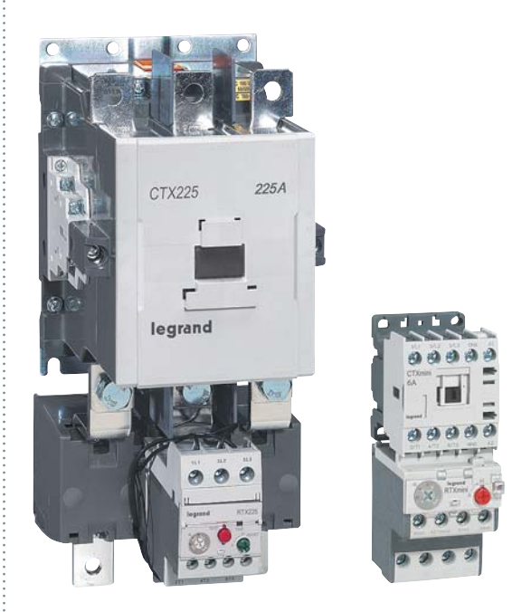
RTX<sup>3</sup> thermal relays can be used to create 0.1 A to 800 A motor starters when combined with contactors, from the CTX<sup>3</sup> mini to the CTX<sup>3</sup> 800.