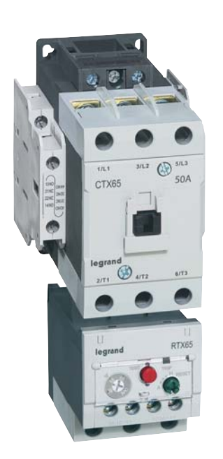
Mounting directly beneath contactors or separately (up 150 A) with the dedicated accessory.