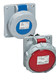
Panel mounting sockets