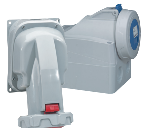
Surface mounting sockets