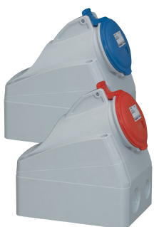
Surface mounting sockets