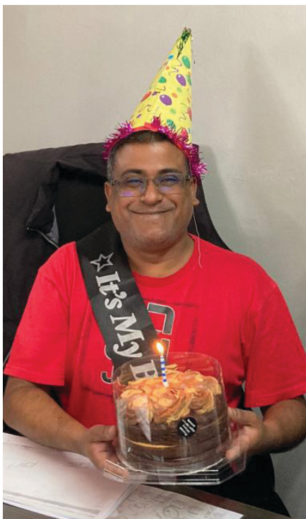
Shikaar - 6th September