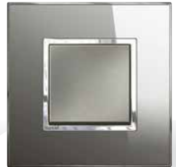
Reflective Stainless Steel