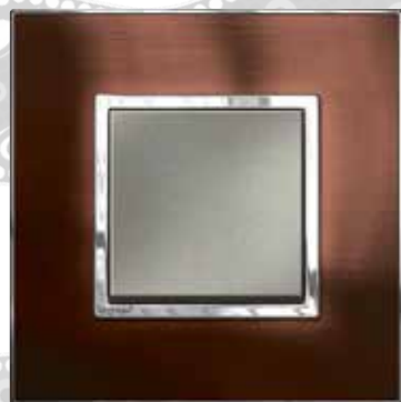
Brushed Pink Champagne

Urban luxury combined with the appeal of unspoilt nature is the theme of this collection. All this can be experienced through the premium materials and first-rate craftsmanship used to produce these finishes. The particularly attractive brushed surfaces lend a rough yet naturally elegant charm to any room.