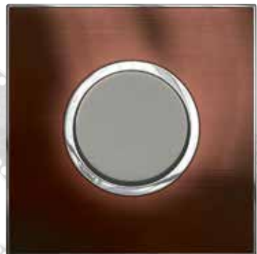
Brushed Pink Champagne