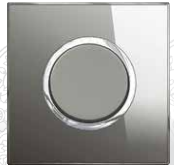
Reflective Stainless Steel